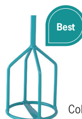
Collomix KR Series